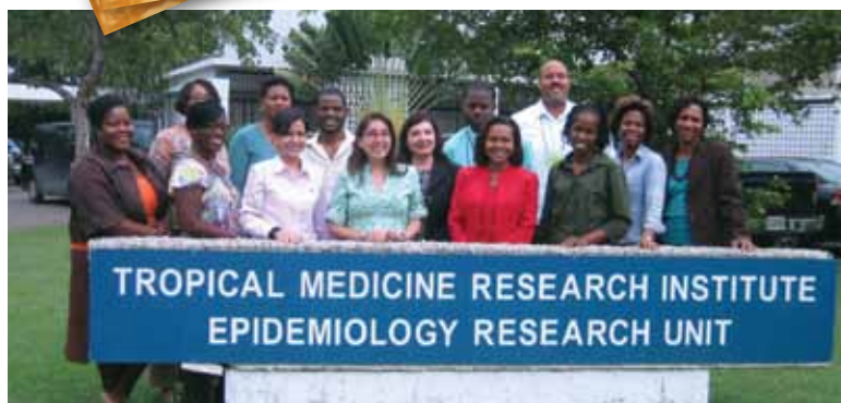
Participants at skills building course.