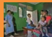
A health care center in Tanzania.

We want to hear from you. Please send us your feedback, as well as letters and ideas on possible stories for TDRnews and on TDR-related tropical disease research issues, events, institutions, publications and personalities. Thank you!