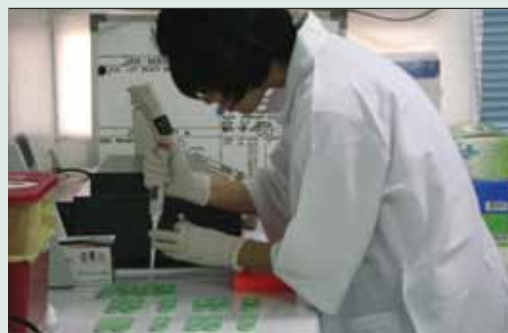
Laboratory evaluation of RDTs.

A report on the second round of WHO-TDR-FIND malaria RDT product testing that included 29 products was released this year for World Malaria Day. This report should assist countries as they choose from dozens of commercially available RDTs.