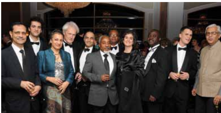
Study 13 scientists win BMJ award.