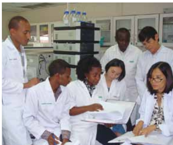
Participants at TDR's training course for GCLP surveyors.

WHO/TDR's Good Clinical Laboratory Practice Guidelines are based on those drawn up in 2003 by the British Association of Research Quality Assurance (BARQA). The guidelines help ensure that the laboratory has the