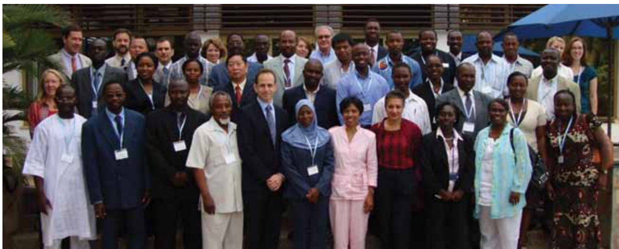
Delegates at the TDR workshop on implementation research.