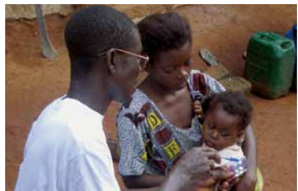
Community-based care in Ghana.

HMM comprises three pillars: the selection and training of community members to correctly dispense antimalarial medicines; an information, education and communication campaign to sensitize caregivers to the importance of adhering to treatment schedules; and making