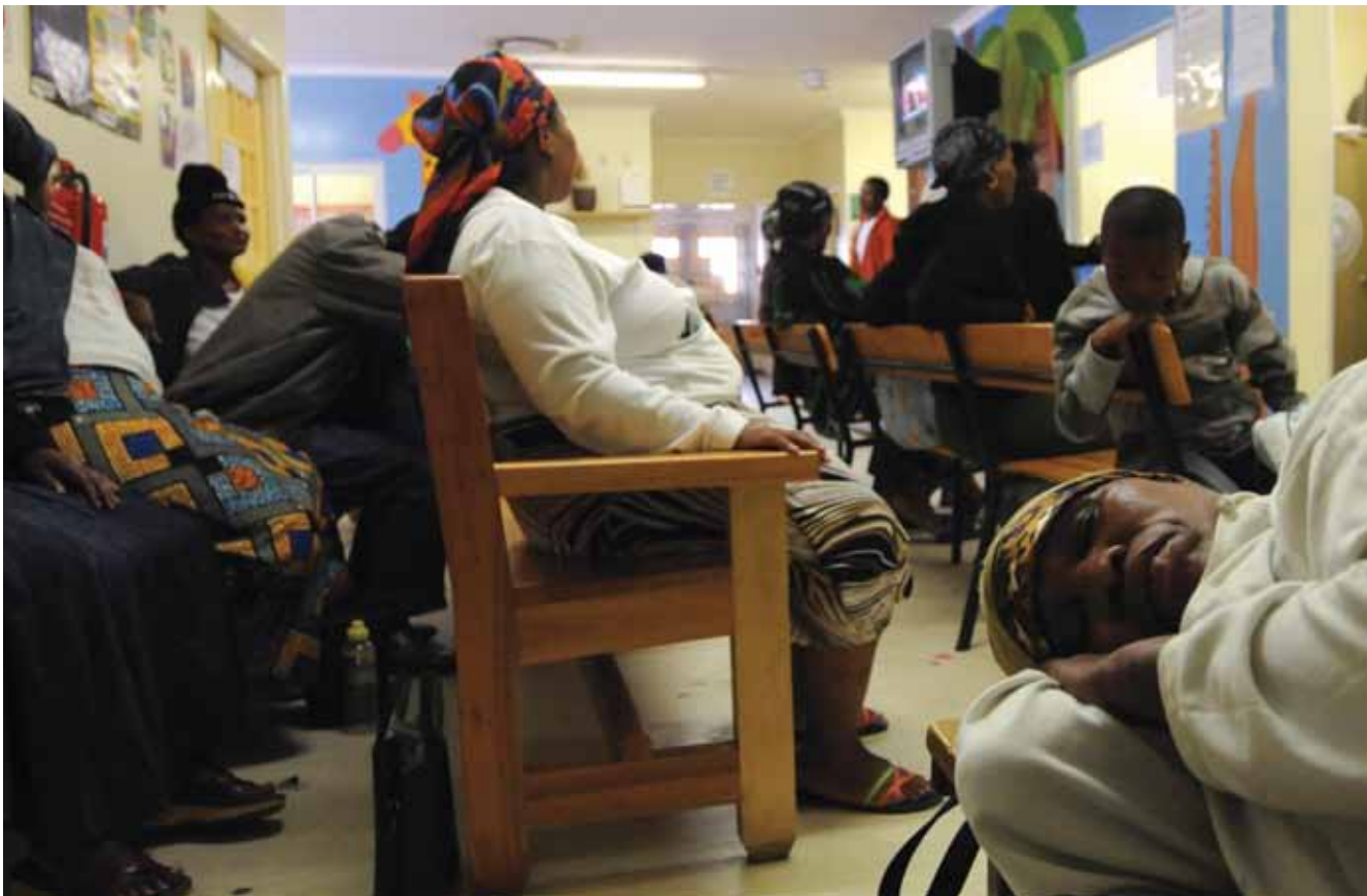
Patients waiting at a clinic in Cape Town, South Africa.