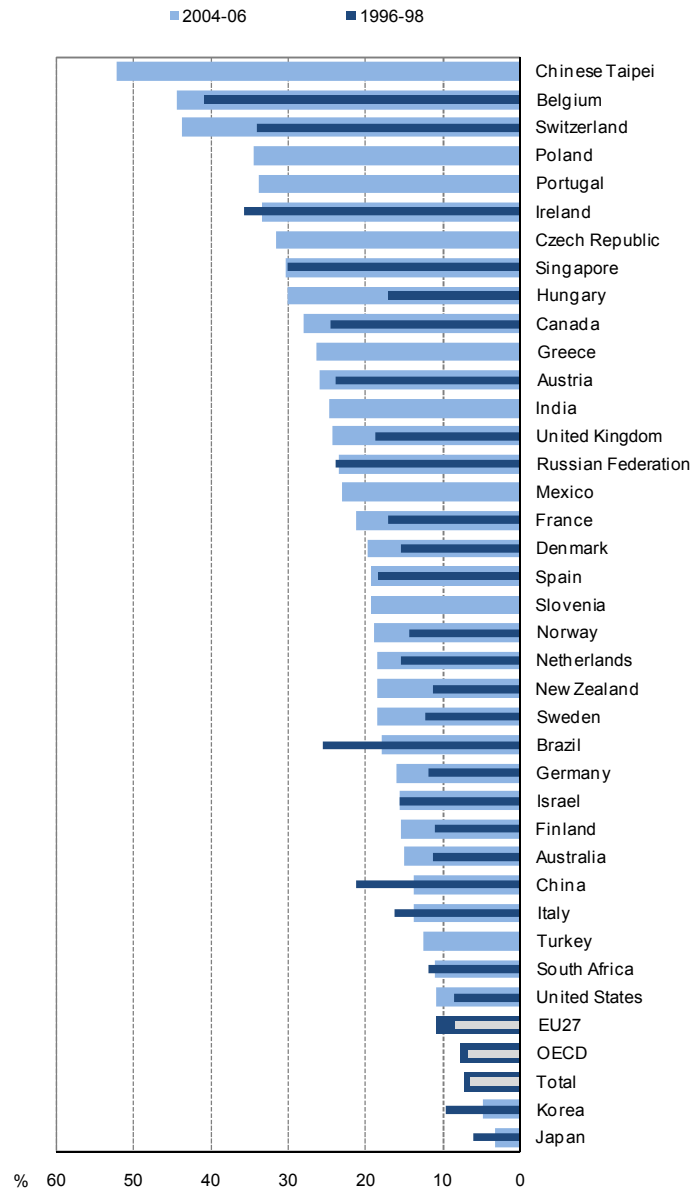
Figure 2: PCT patent applications with co-inventors located abroad (2004-06)

30%. Whereas Canada, Sweden and Germany have all increased their levels of international co-patenting over the last eight years, China has experienced a contraction (of approximately 30%) in international co-invention.